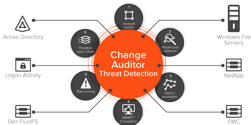
Figure 2. Overview of the Change Auditor Threat Detection input sources and threat assessment process

Threat Detection process includes the following steps: