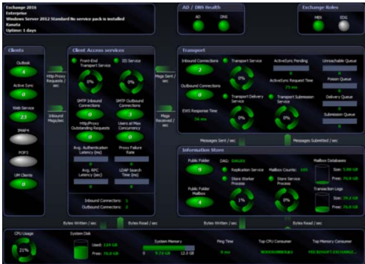
Figure 1. Example of a Diagnostic Console for Exchange 2016.