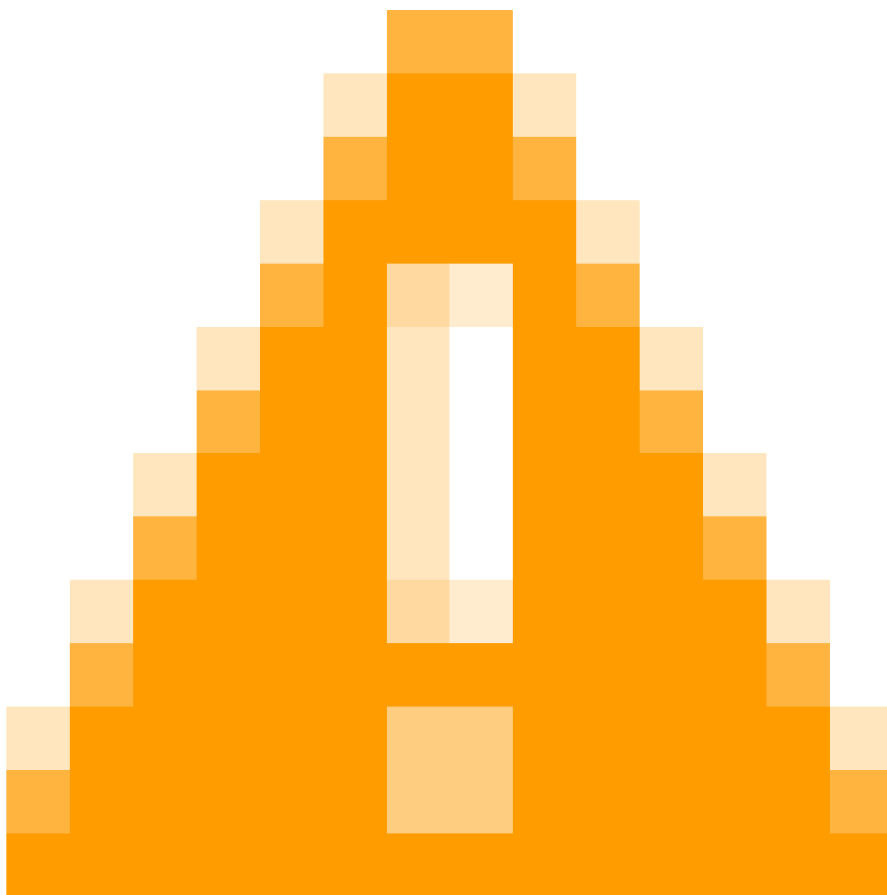
Table Cell Outside Table: CAUTION:

According to the current inWebo policies, your API token expires if it is not used for 30 days. Make sure that you use it regularly, because SPS will reject your sessions if the API token is expired.