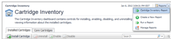
Figure 1. Cartridge Inventory Report