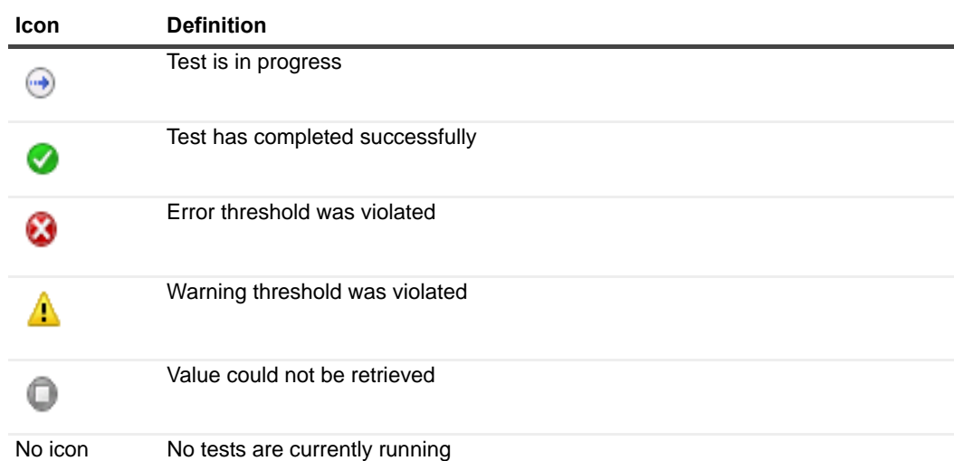
Table 4. Test result icons.

Colored icons adjacent to a test in the Test node, servers in the organization node, or tests in the Test Results window indicate the following test status: