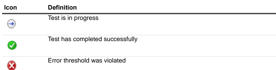
Table 15. Test result icons.

Colored icons adjacent to a test in the Test node, servers in the organization node, or tests in the Test Results window indicate the following test status: